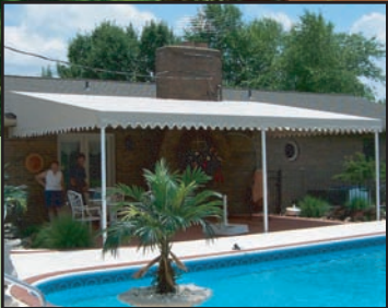
sun and UV protection