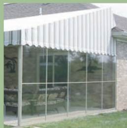
Clear View Sidewall