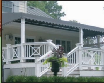
extended living space