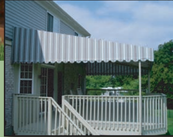
reduce cooling costs