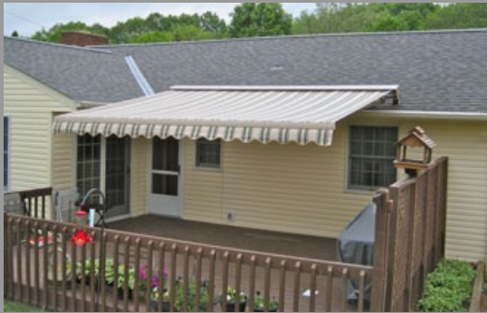
FULLY EXTENDED ROOF-MOUNTED AWNING

EASILY EXTEND AND RETRACT YOUR AWNING WITH THE PUSH-OF-A-BUTTON