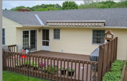
RETRACTED ROOF-MOUNTED AWNING

THE BEST VALUE IN A MOTORIZED, RETRACTABLE AWNING! PROFESSIONAL EXPERIENCE WITH GUARANTEED INSTALLATION